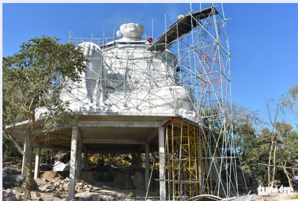
Figure 3: The new statue of Ba Chua Xu.

to “praise Ba Chua Xu” are traders and businessmen around the country. In the process of “praise Ba Chua Xu”, traders come to “Get a godsend from Ba Chua Xu” to do business. Usually, “Get a godsend from Ba Chua Xu” is at the beginning of the year according to the lunar calendar (from January to April) and at the end of the year, they come for Thanksgiving. Or in some cases, tourists combine Thanksgiving in the previous year and getting a godsend in the new year on the occasion of lunar new year. This combination includes activities such as offering costumes and jewelry to Ba Chua Xu, the offerings include fruits, fresh flowers, votive papers, roast pork, ... Besides, the visitors also offer cash which is received by the management board of Ba Chua Xu shrine relic instead and used in restoring, supporting to complete the infrastructure system at the locality and organizing charitable activities or events related to Ba Chua Xu shrine.