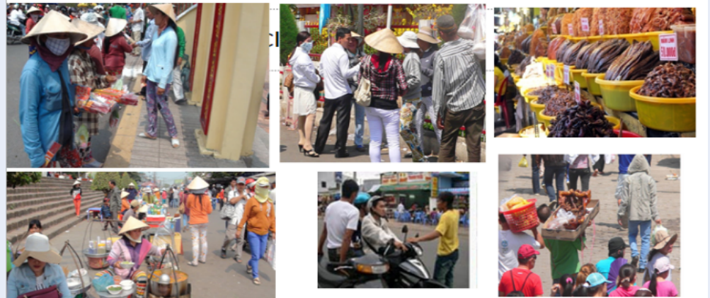
Figure 2: Service in Chau Doc — An Giang.

(Chau Doc) and continue to be promoted. In the exploitation and development of tourism in this spiritual tourism today, although the local authority has made certain efforts, it still has barriers profoundly affecting the goals of stable tourism development of the locality. Because the economic values have emerged but the cultural and sociable values tend to be affected. The focus of Sam mountain complex in the exploitation and development of tourism is a tourism complex of Ba Chua Xu shrine - Thay Tay An Pagoda - Thoai Ngoc Hau Tomb. Bustling scene of the people visiting these worship places is common here. Especially in the high season, from 23 to 27 April according to the lunar calendar when people come here to worship Ba Chua Xu; on 14 August according to the lunar calendar for worshipping Buddha Thay Tay An, it is difficult